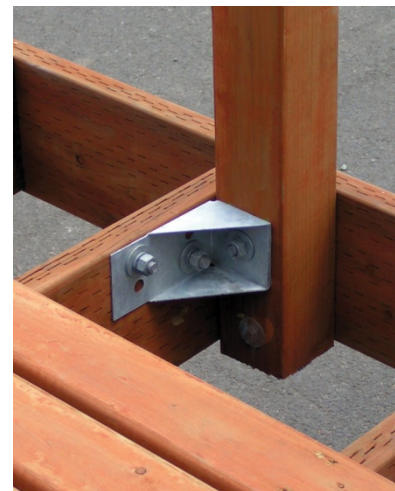
FIGURE 1—DECKLOK CONNECTOR GEOMETRY AND DIMENSIONS